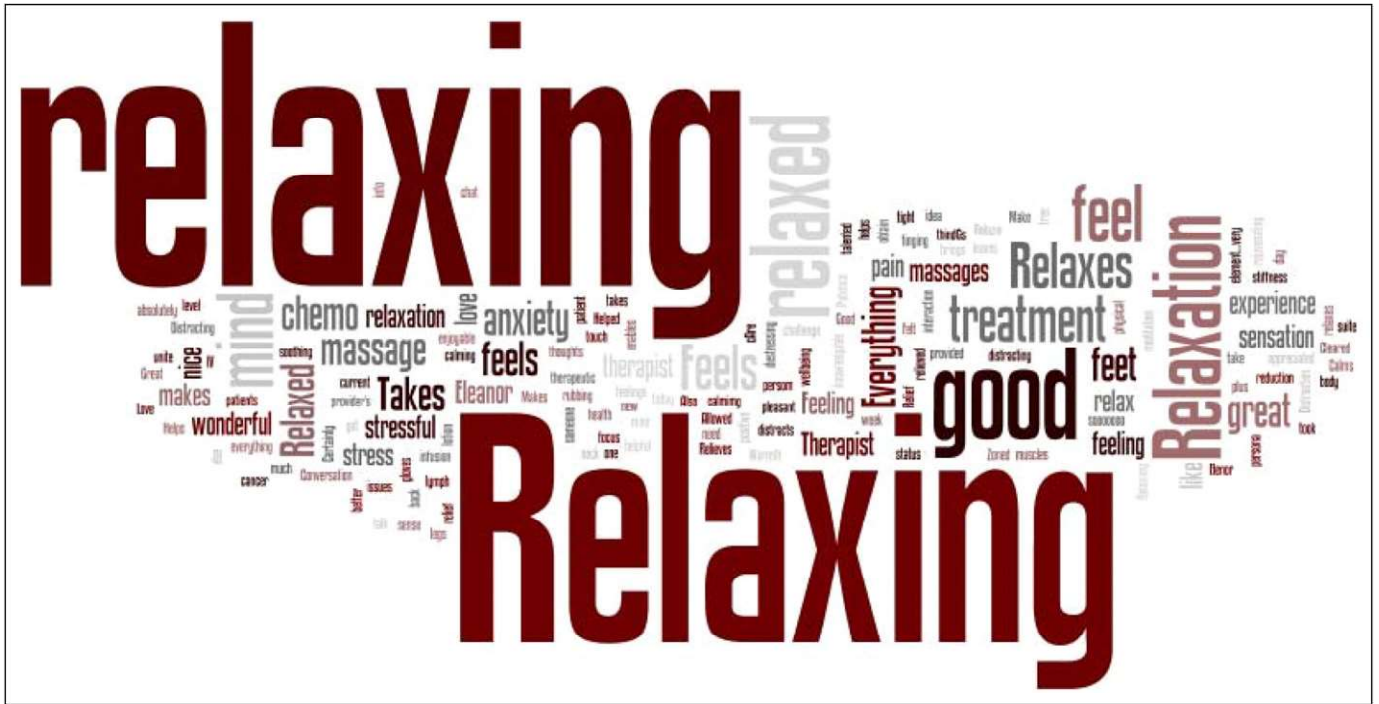
FIG A1. Word cloud from patients' spontaneous written words.